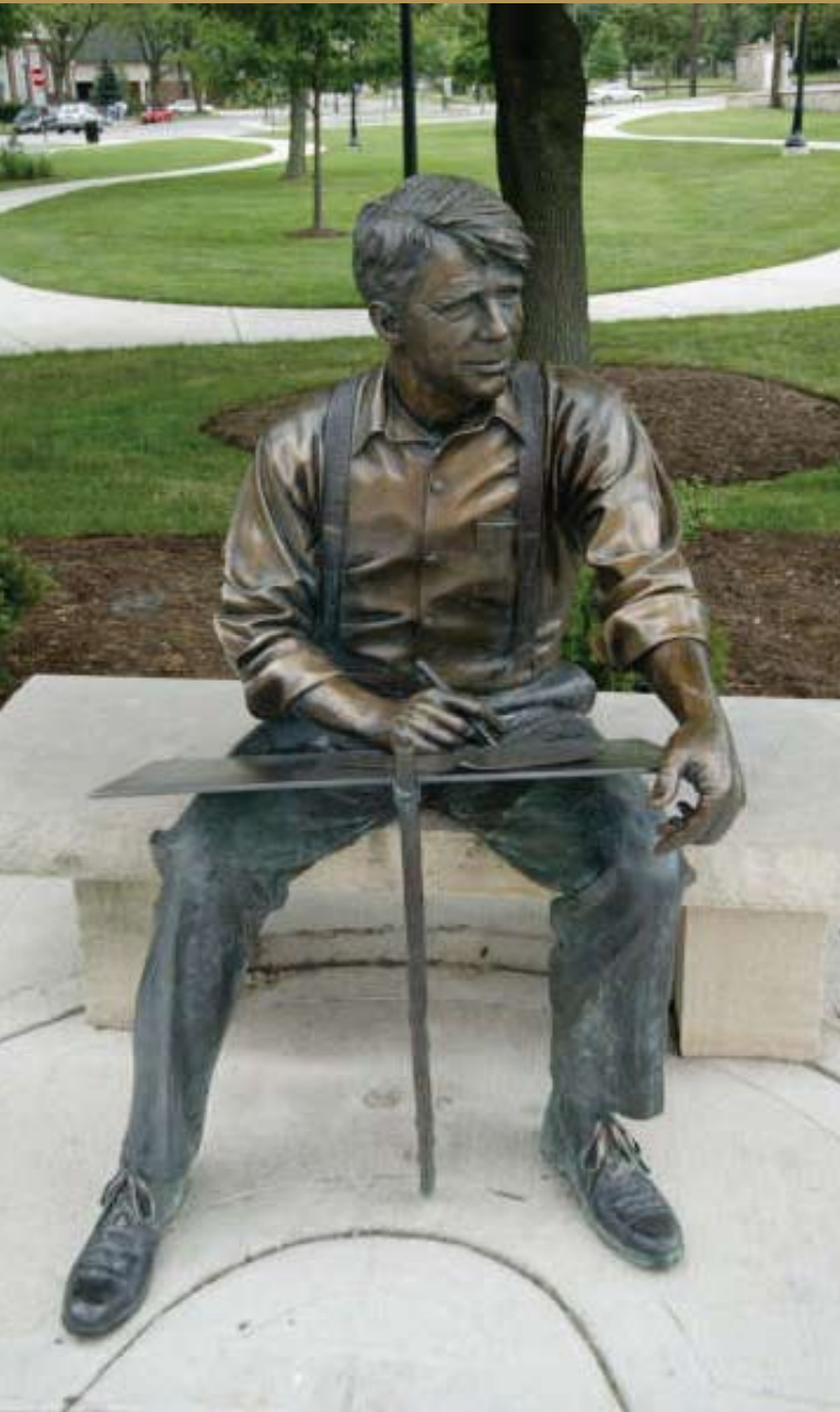
Robert Frost Statue