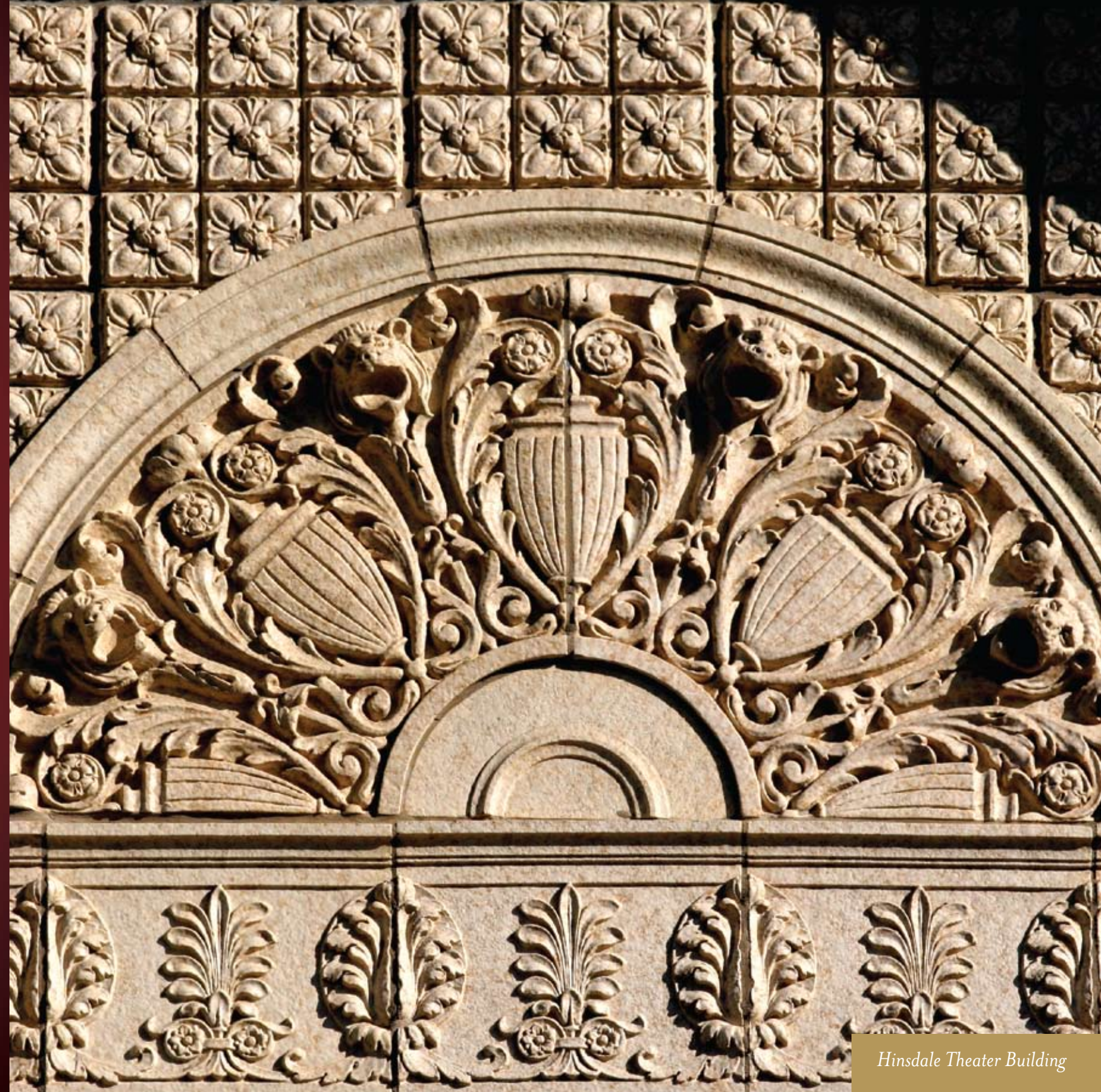
Hinsdale Theater Building